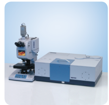
VERTEX 70v and HYPERION 2000 IR microscope. Up to five beam exit ports are available for multiple external modules.