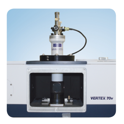
Big and customizable sample compartment provides sufficient space for bulky accessories.