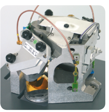
RockSolid™ interferometer used in the VERTEX 70v FTIR spectrometer